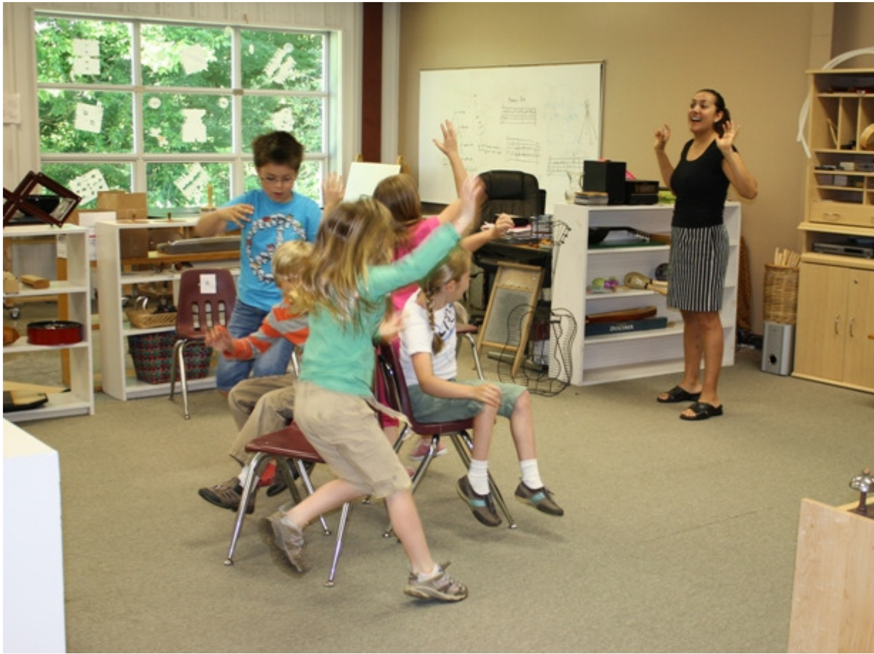
Local Libraries Offer Children's Summer Reading Programs